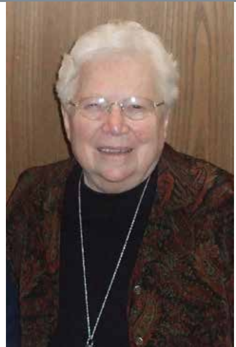
FORMER PRINCIPAL OF HOLY ANGELS ACADEMY DIES Was Also Professor of English & Archivist at D'Youville College